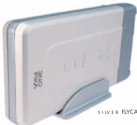
SILVER FLYCASE USB2